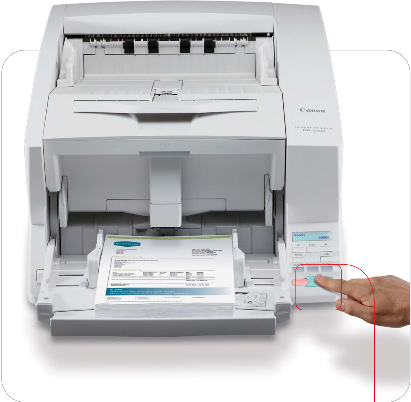
The paper tray can be configured with 3 different height positions according to the volume of paper being scanned.